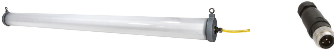
3 Pin Connector